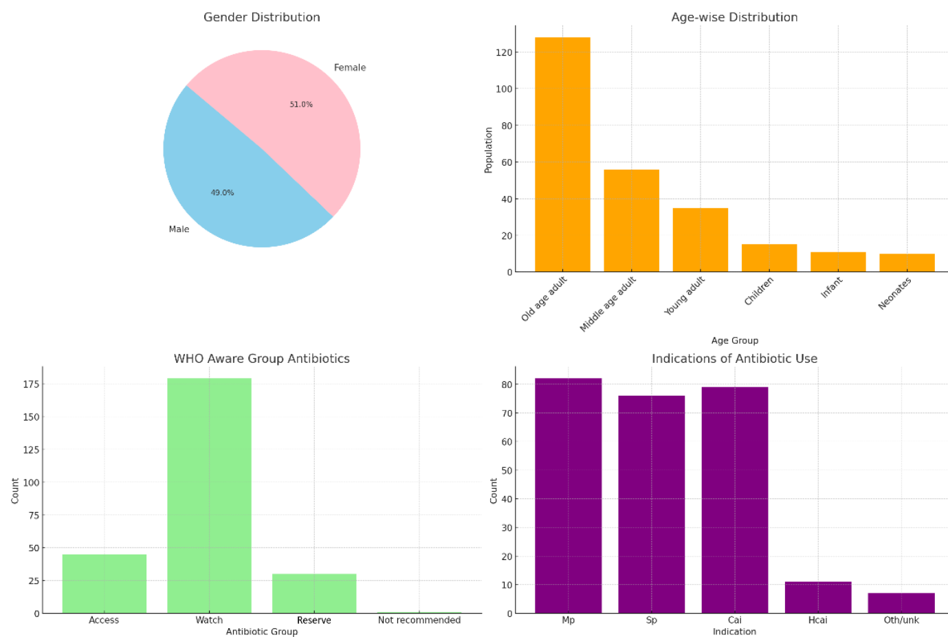
Figure 1 Demographic and Study Characteristics

The results provided a multifaceted overview of the demographic characteristics and antibiotic usage patterns within the study population. The first chart, illustrating the gender distribution, shows a slight predominance of females over males, with females constituting 51% of the population and males comprising 49%. This balance underscores the nearly equal representation of genders in the study.