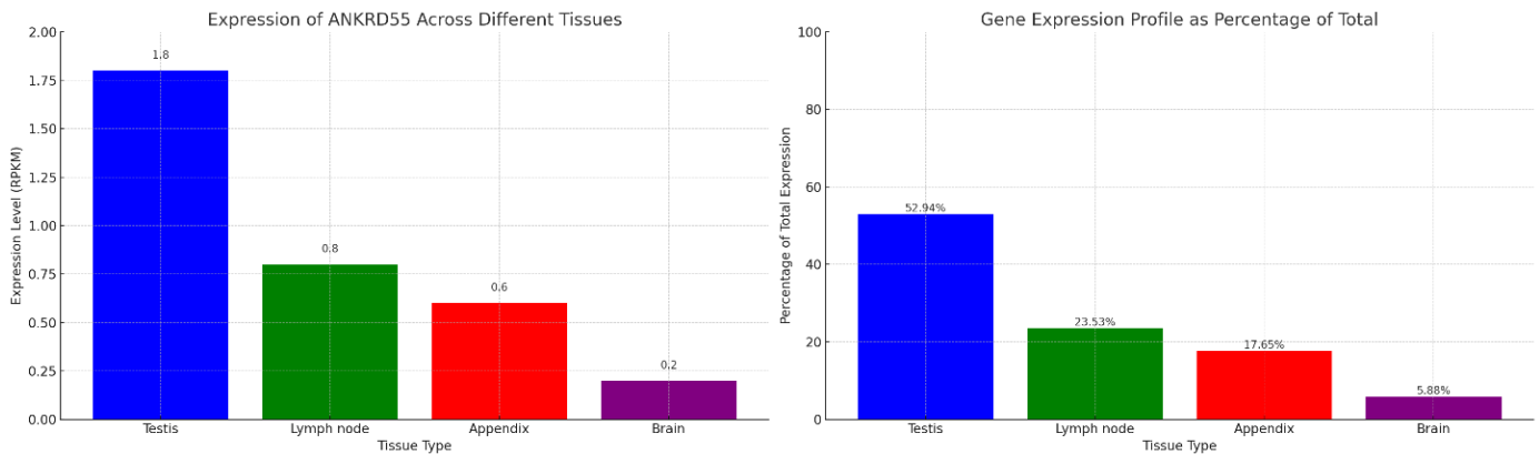
Figure 1 ANKRD55 across different tissues